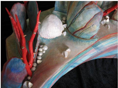
Treasure Site 10.5"x15.5"x16" By Jayme Curley

The Bellingham Arts Commission (BAC) is seeking small sculptures to display in the lobby of City Hall located in downtown Bellingham. The BAC encourages artists to take advantage of this opportunity to show their work in this highly visible location. All accepted artwork will be on display for an eight week period. Although Whatcom County artists are encouraged to apply, all artists (accomplished or emerging) are welcome to participate in this call for art.