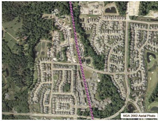
Figure 2 - 2002

Pipeline safety and environmental regulations have generally focused on the design, operation and maintenance of pipelines and incident response. They have not directed significant attention to the manner in which land use decisions in proximity to pipelines can affect public health and safety.