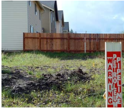
Figure 4 – Fence on pipeline easement

Activities of greatest threat to the pipeline are those that occur within the pipeline's right-of-way. The communication here is primarily between the pipeline operator and the property owner. These activities should be governed by an easement negotiated with individual property owners. The easement is held by the operator and includes the right to operate, maintain and repair the pipeline. These easements may not always be well defined but they should be recorded with the deed. While pipeline operators can always use assistance in educating landowners and identifying when easement rights are being violated, the job of enforcing easements rests with the operator.