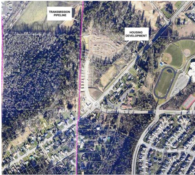
Figure 3 – Subdivision with Pipeline Location

Planners should overlay the pipeline maps with their zoning maps and consider whether any action should be proactively taken. Consulting with the pipeline operator can help educate planners about the pipeline's contents, volatility, pipe pressure, depth and other characteristics. In doing so, planners can develop a better understanding of the consequences associated with a pipeline leak or rupture and determine the range of influence of the pipeline. For instance, a high-pressure natural gas pipeline rupture will have a range or zone of consequence that goes significantly beyond the pipeline's right-of-way.