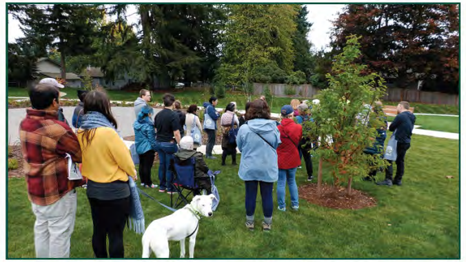
Arbor Day sustainable landscapes workshop

Several hundred people engaged with the City through this event and had the opportunity to ask staff questions about tree regulations and what the City is doing to preserve our urban forest.