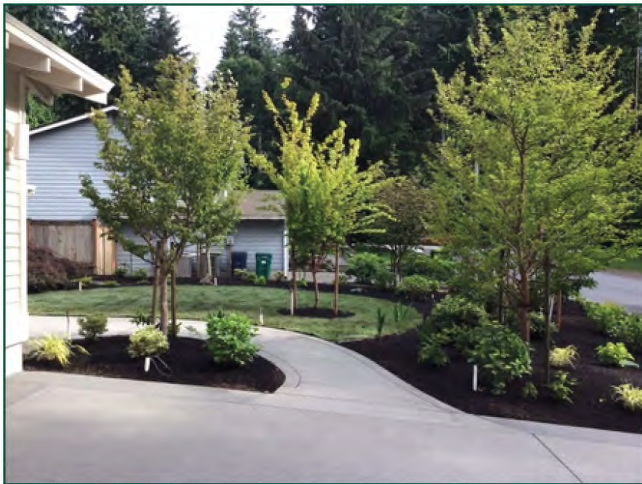
Trees planted through rebate program