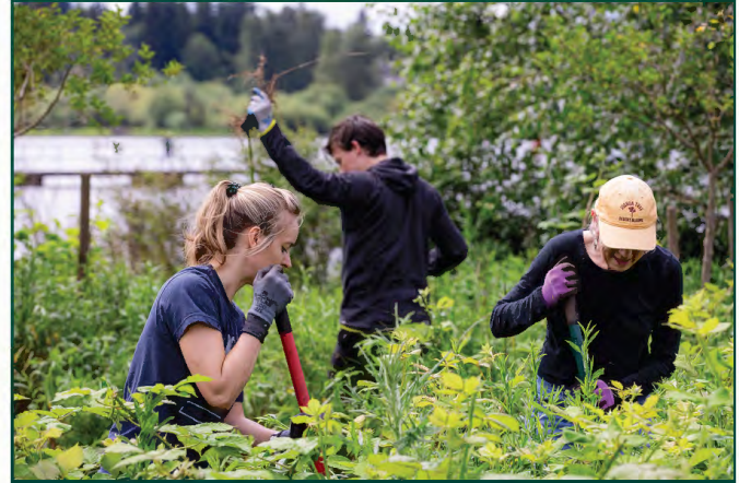
Volunteers at GKP event