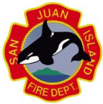
Exhibit 4 San Juan Island Fire Department Organization