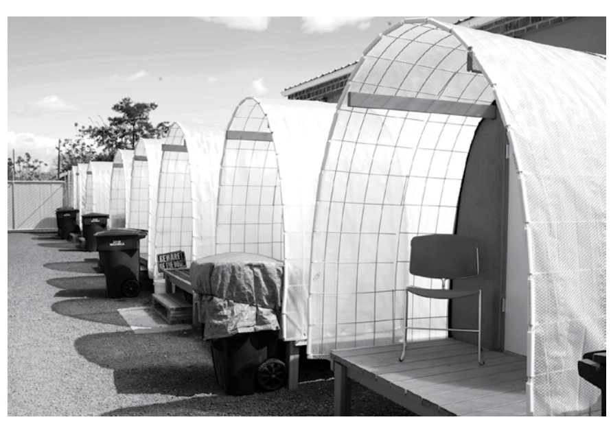
Walla Walla's Conestoga Huts.

The village has 29 tiny houses for single adults and couples without children. The tiny houses are each 8' x 12', insulated, have electricity and heat, windows, and a lockable door. There is also a security house, a communal kitchen, meeting space, bathrooms, showers, laundry, a case management office, and 24/7 staff providing security and management. Residents