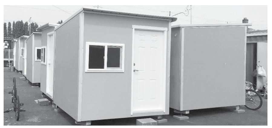
Olympia's new micro shelters at the downtown mitigation site.

The city developed a downtown mitigation site on a city-owned parking lot that includes 115 spots for individual tents, potable water, and portable toilets. Catholic Community Services provides oversight under contract. The city reports a $50-$70,000 startup cost and $200,000 annual operating costs. The mitigation site has a code of conduct that includes requirements, such as no drug dealing.