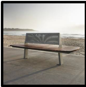
Streetscapes, Inc. Mollymook Streetscape Bench Hardwood Kwila Timber Laser Cut Backrest Mild Steel Frame Wood Finish - Natural Frame Finish - Powder Coated