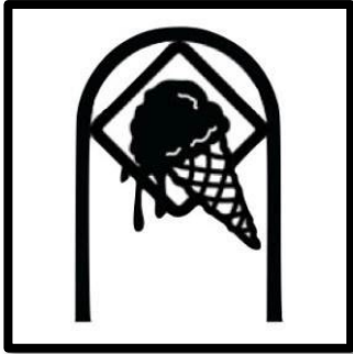
Streetscapes, Inc. Melting Cone Bicycle Rack Parking Capacity - Two Bicycles Finish - Powder Coated