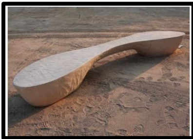
Streetscapes, Inc. Cityscape Bench Designed by Arne Quinze Waterproof and Graffiti Protection Dimensions - 153.54?W x 19.69?D X 12.21?H Material - Cast Stone