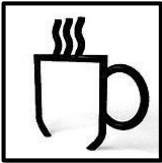
Streetscapes, Inc. Coffee Mug Bicycle Rack Parking Capacity - Two Bicycles Finish - Power Coated