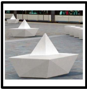
Streetscapes, Inc. Paper Boat Cast Stone Bench Designed in the spirit of "design for all" including people with disabilities. Construction - Cast Stone