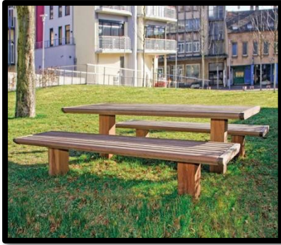
Architonic.com Urbanis modular system Manufacturer Westeifel Werke Designer Team Westeifel Werke Architonic id 1235439