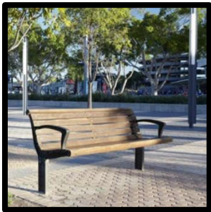
Streetscapes, Inc. Sydney Bench Designer - David Shaw Boulevard UpCycled Urban Hardwood Cast Aluminum Frame and Armrests Finish - Powder Coated