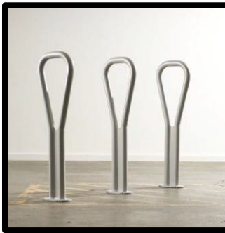
Streetscapes, Inc. Paper Clip Bicycle Rack Mild Steel Tubular Construction Finish - Powder Coated